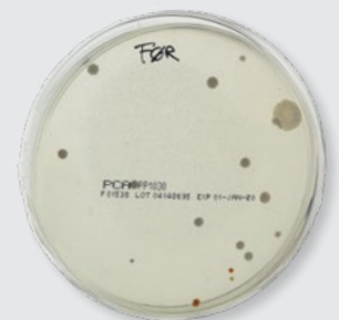
Result cotton swab test before washing