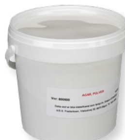
Agar powder, normal quality Article n° C800500-0400