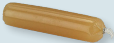
Meat peptone agar, roll (bacteria) Article n° F800728

Heat up with demineralised water, boil for 10 minutes and pour into a petri dish