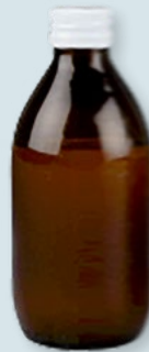
Meat peptone agar in bottle (bacteria) Article n° F800738