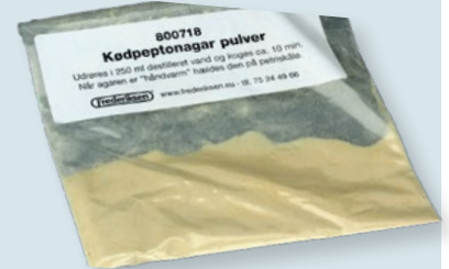
Meat peptone agar, powder 250 ml Article n° F800718