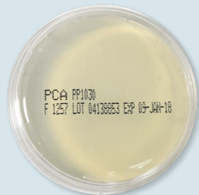
Petri dish PCA Diameter 90 mm (10 pc) Article n° 116552 Diameter 55 mm (20 pc) Article n° 119900