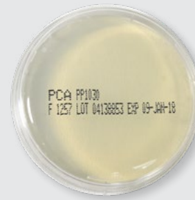
Petri dish PCA Article n° I16552 (90 mm, 10 st) Article n° I19900 (55 mm, 20 st)