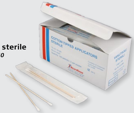
Cotton swab, sterile Article n° F048550

If necessary, extend the test by disinfecting the hands after washing. What can you deduce from the test?