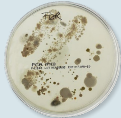
Result handprint before washing

Remember to take the plates out of the fridge 30 minutes before use!