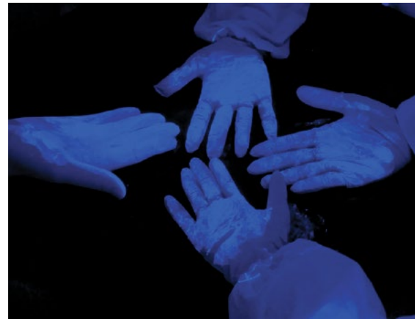
Spreading of infectious diseases Article n° F778166

Wavelength: 365 nm. Works on 4 x AA batteries (not included) Article n° F287110