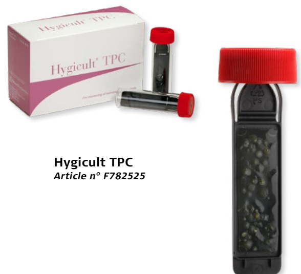
Hygicult TPC Article n° F782525

Compare the contact plates before and after according to the manual.