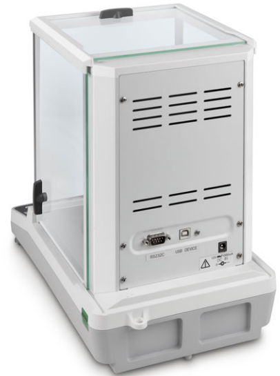
KERN ACS/ACJ with standard data interface RS-232 and USB

The bestseller in analytical balances, with high-quality single-cell weighing system, also with EC type approval [M]