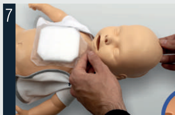
Fit the face skin, checking that the nose, mouth and upper tab are in the correct position.