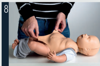
Place chest skin and attach to the studs.