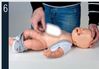
Place the lung on the chest