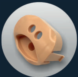
VALVE (Ref. SP-002 (PB))