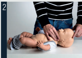
Remove the face skin.