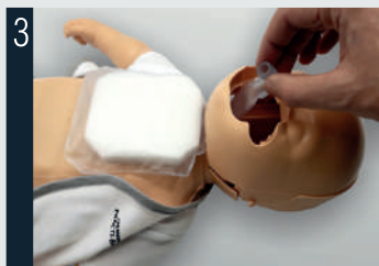
Move the lung to below the jaw.