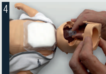
Connect the lung to the valve.