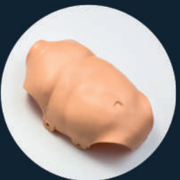
CHEST SKIN (Ref. Chest-PB)