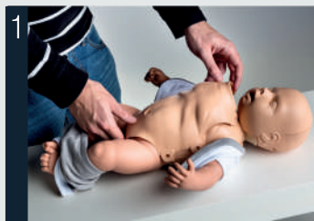
Remove the chest skin.