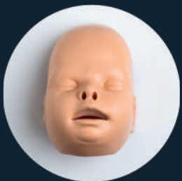
FACE SKIN (Ref. Face-PB)