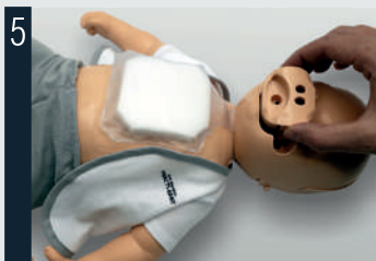
Make sure the valve is correctly attached to the head.