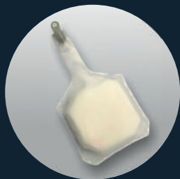
LUNG (Ref. SP-001 (PB))