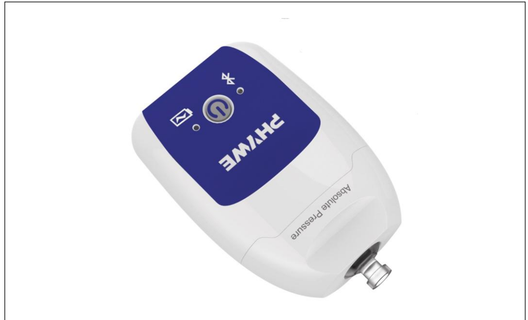
Fig. 1: 12905-01 Cobra SMARTsense Pressure 20... 400 kPa