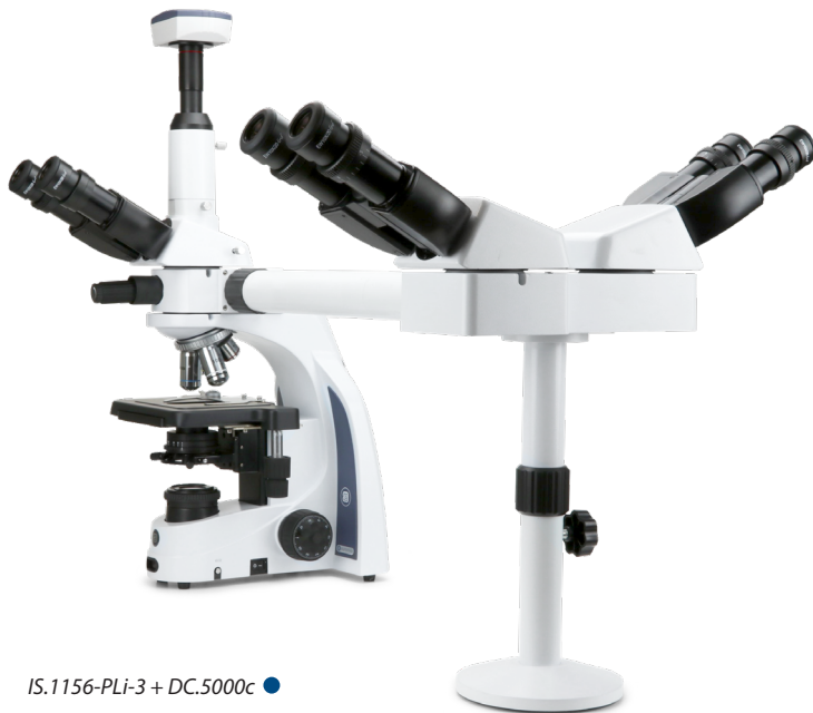
IS.1156-PLi-3 + DC.5000c ●