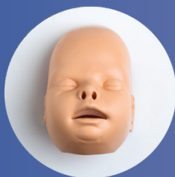
FACE SKIN (Ref. Face-PB)