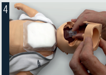
4 Connect the lung to the valve.