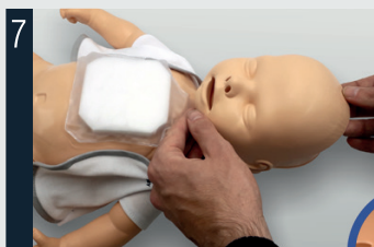
7 Fit the face skin, checking that the nose, mouth and upper tab are in the correct position.