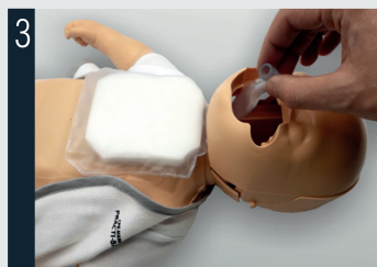
3 Move the lung to below the jaw.