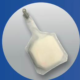
LUNG (Ref. SP-001 (PB))