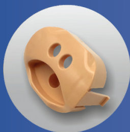
VALVE (Ref. SP-002 (PB))