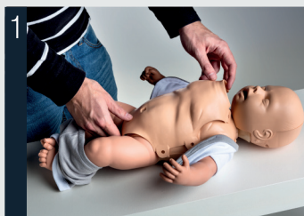
1 Remove the chest skin.