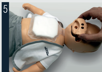
5 Make sure the valve is correctly attached to the head.