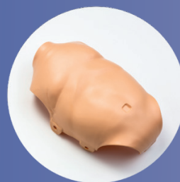
CHEST SKIN (Ref. Chest-PB)