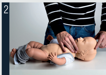
2 Remove the face skin.