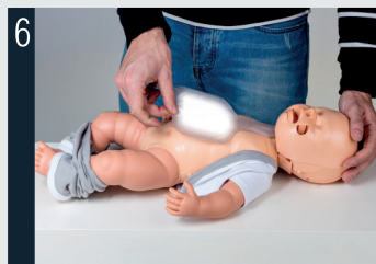
6 Place the lung on the chest.