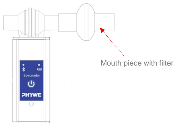
Fig. 2: Connecting the mouthpiece with filter

Attach the supplied mouthpiece with filter to the sensor.