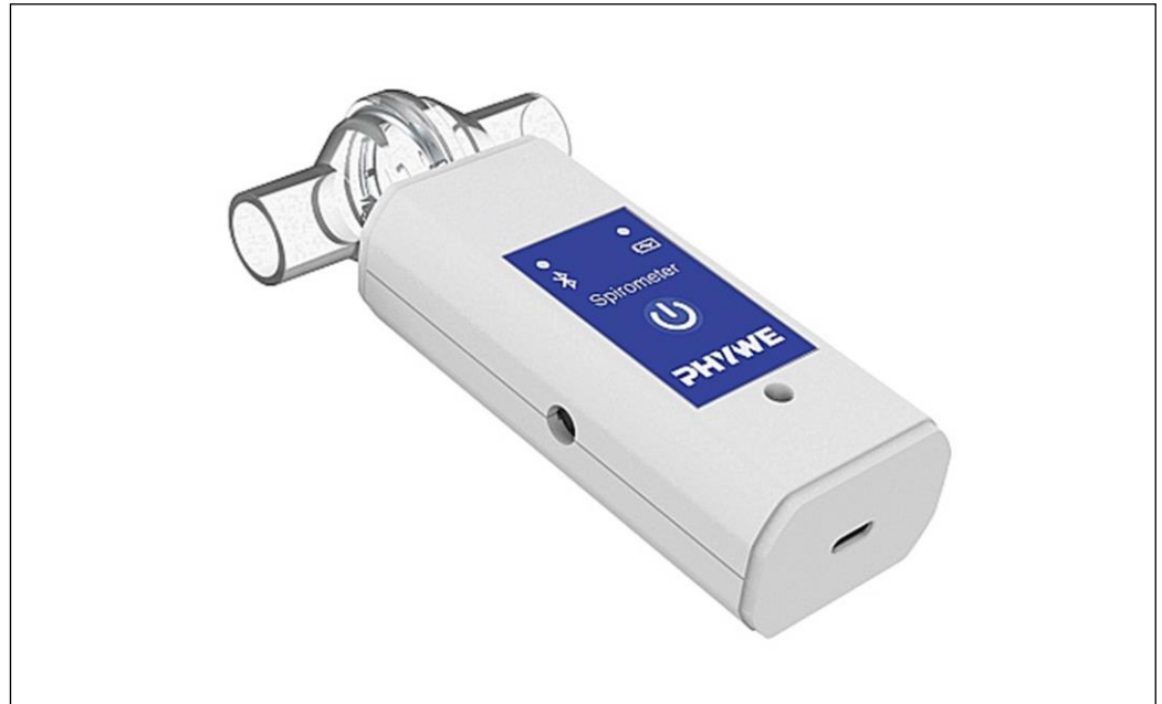
Fig. 1: 12936-01 Cobra SMARTsense Spirometer

The unit complies with the applicable EC-guidelines