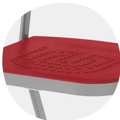
Absolutely robust frame, thanks to 2 mm thick steel pipe and seamless welds