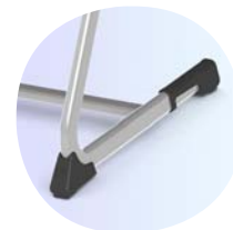
Protects floor and chair: A2S-floor protectors