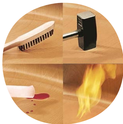
Indestructible WOODPLAC shell, scratch, break, shock resistant & flame-retardant