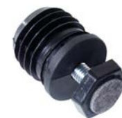
Floor protectors with levelling