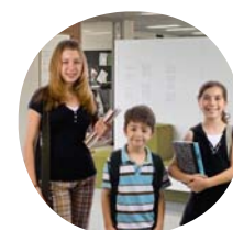
Frame sizes for all ages