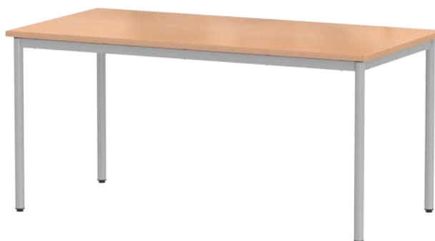
Table top, 3-layer particleboard surface, melamine coated, Highly abrasion resistant, with 3 mm corner radius, seamless with 3 mm plastic edge, thickness: 25 mm, Four-legged base frame, Legged round tube: 40/2 mm, frame square tube rounded: 40/20/2 mm, welded, epoxy coating, Floor protectors with levelling, Size according to DIN EN 1729: 3-7, 72+75 cm, Information to table heights refers on a tabletop thickness of 25 mm