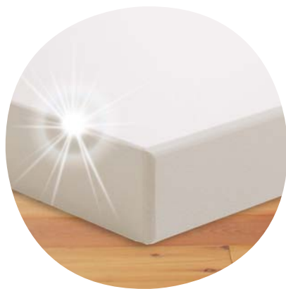
Sturdy, 25 mm thick table top with seamless laser edge made of polypropylene