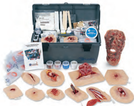
025 Xtreme Moulage Kit