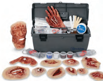
620 Xtreme Moulage Kit