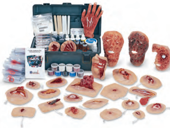
028 Xtreme Moulage Kit