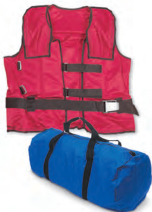
1118 Weighted Vest and 2094 Carry Bag