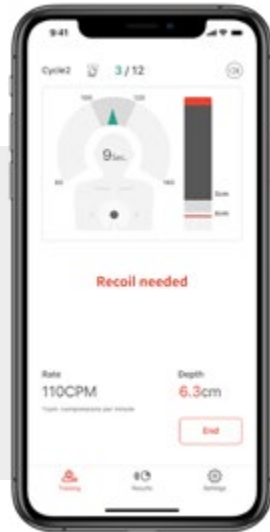
Intuitive Student Feedback App monitors and analyses performance improvement