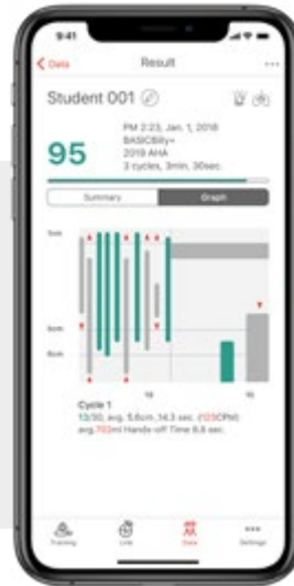
Student's results can be saved and offer a complete debriefing functionality