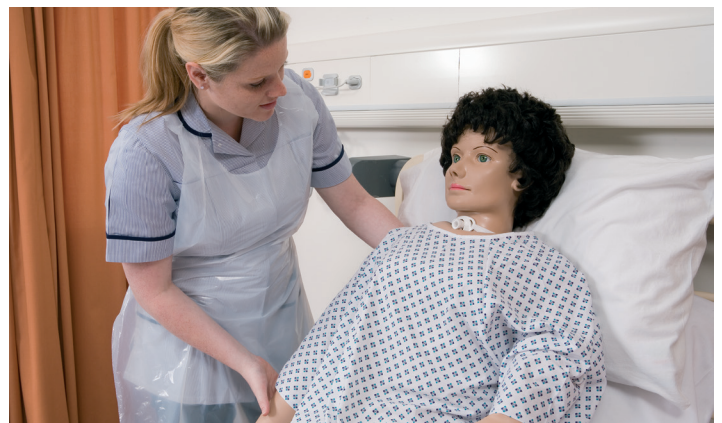
Tracheostomy care and dressing