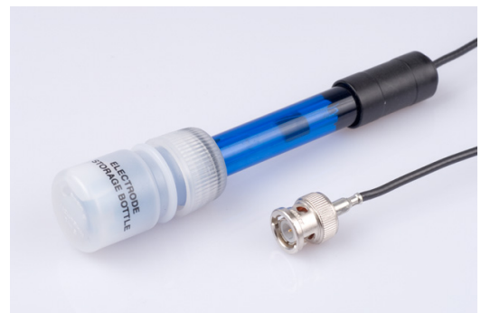
Figure 2. The pH Electrode (031).

The CMA pH electrode is designed to make measurements in the pH range of 0 to 14. It has a coax cable, with a BNC connector. The electrode (made from glass) is built in a plastic tube with an opening at the bottom side. It is supplied in a bottle filled with a protective solution. When the pH electrode is not being used, it must be kept in this liquid. For use and maintenance of the CMA pH electrode follow instructions given in its User's Guide.