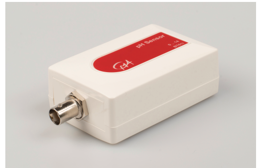
Figure 1. The pH Amplifier (BT61i).

The CMA pH amplifier is a device, which allows a standard combination pH electrode (such as the CMA pH Electrode (031)) to be monitored by a lab interface. The pH electrode is connected to the pH amplifier via BNC connector located on one end of the sensor box. The pH amplifier adjusts the voltage produced by the pH electrode to a range between 0 to 5 V, which can be measured by an interface.