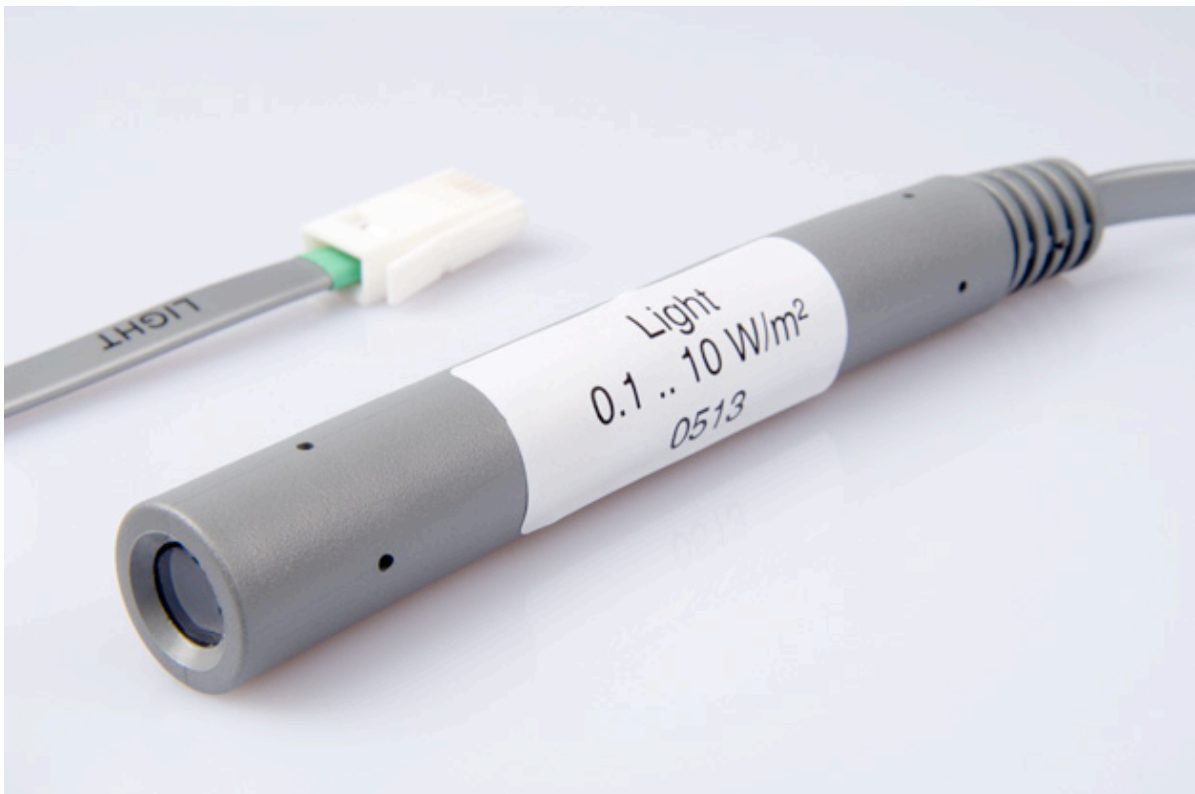
Figure 1. The Light Sensor